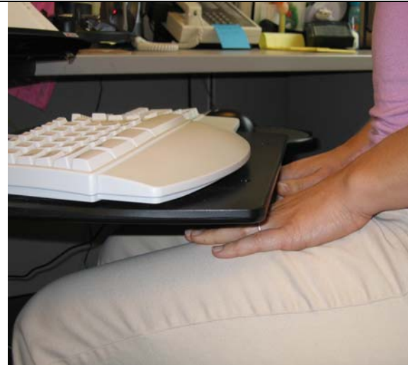
Correct amount of room between keyboard tray and lap.