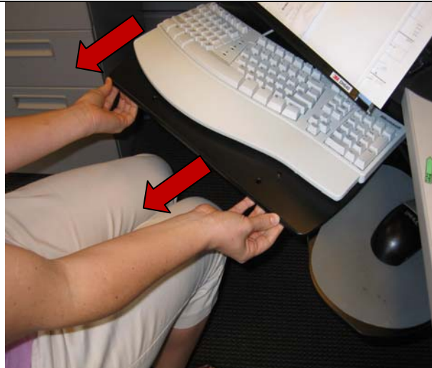
Pull to move out from under desk, push to position under desk.