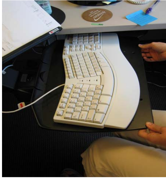
Swings out of way.