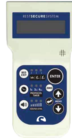
Hand Control shown in blue; also available in green.

This card is not meant to replace product user manual. For complete manual, contact Sizewise.