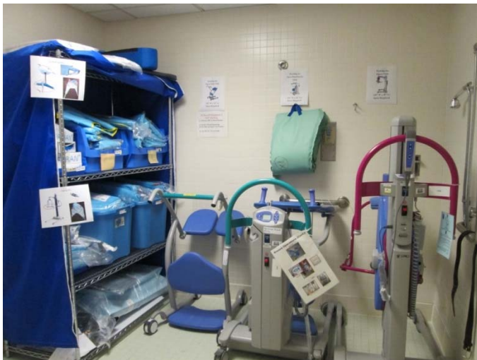
Example of organized storage room: parking signs for equipment, hooks for the belt slings, disposable slings properly stored and labeled for differentiation.