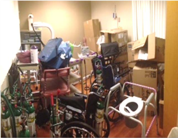
Example of a storage room lacking organization