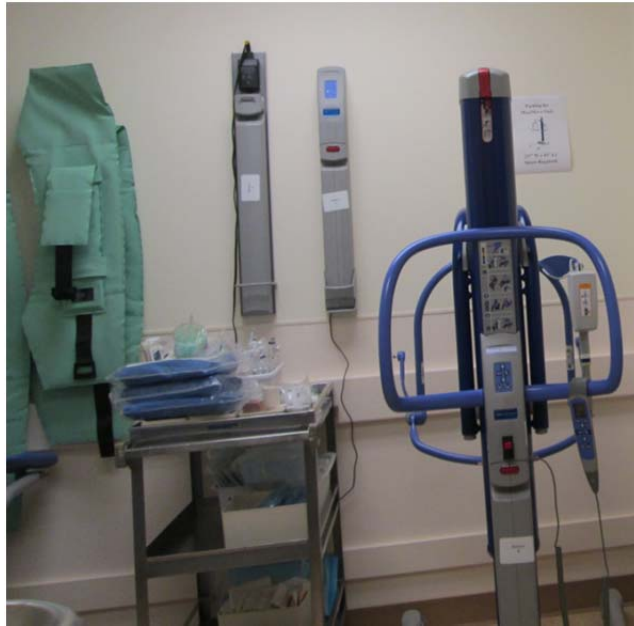
Battery chargers mounted on the wall and hooks used to hang belts. (Note lower mounting of batteries is preferred when possible.)