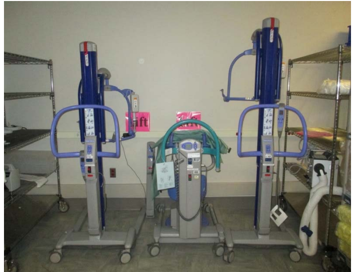
Although there are signs, there are no hooks to mount the batteries and the belts, which are laid on the equipment.