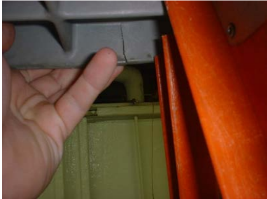
Above: A crack is discovered on the top step of a ladder that had been used improperly. The top step is not for