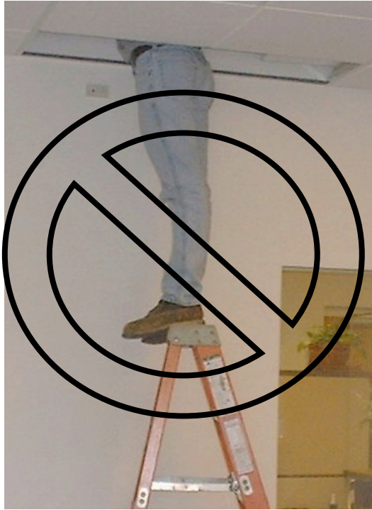
Always practice ladder safety! Cheat a little and you could lose a lot.